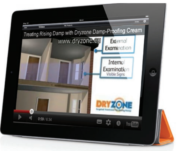
Visit www.dryzone.eu to view the Dryzone video.