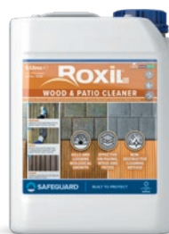
ROXIL® 100 WOOD & PATIO CLEANER (RECOMMENDED)