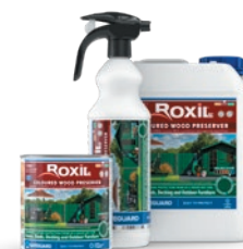
ROXIL® COLOURED WOOD PRESERVERS

If staining is required, Roxil® PC Coloured Wood Preservers offer the same protections and are available in a range of fade-free colours. It is recommended to apply the stain first and allow the fence to fully dry before applying an overcoat.