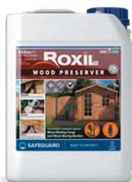
ROXIL® ENHANCED DECKING OIL