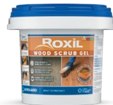
ROXIL® WOOD SCRUB GEL (RECOMMENDED)