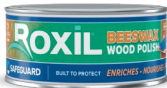
ROXIL® BEESWAX WOOD POLISH