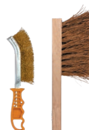
STIFF WIRE OR NATURAL BRISTLE BRUSHES