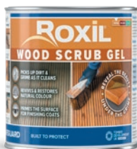
ROXIL® WOOD SCRUB GEL